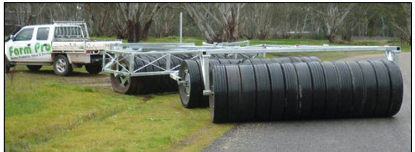
No Corner Cutting

Australian Designed, Manufactured & Supported