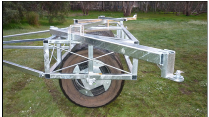
Unit 2 & Unit 3 Arms Open