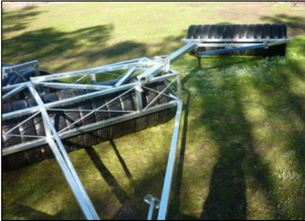
Sharp Turning Angle