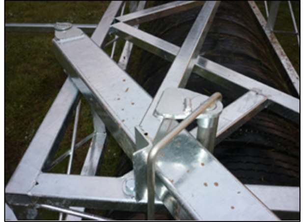
Solid Steel Frame With Positive Arm Locks