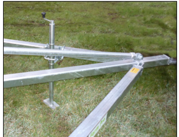
Adjustable Drawbar Height & Stand