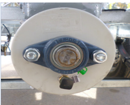
Full Flush Out Inlet