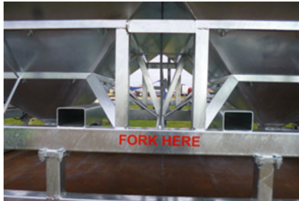
Fork Lifting Point