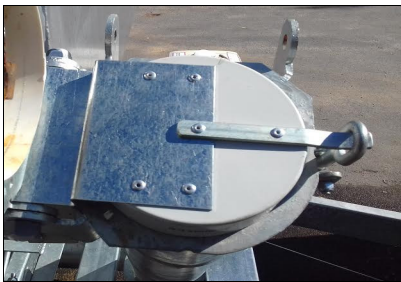
Weather Protection Cap