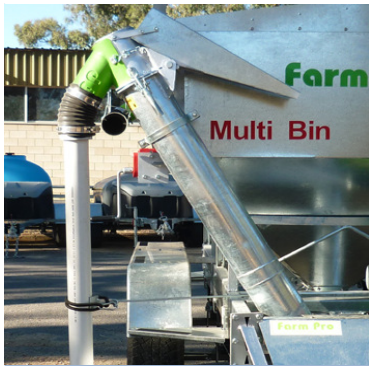
Side Discharge, Dual Pictured (Chute and Drop Tube)